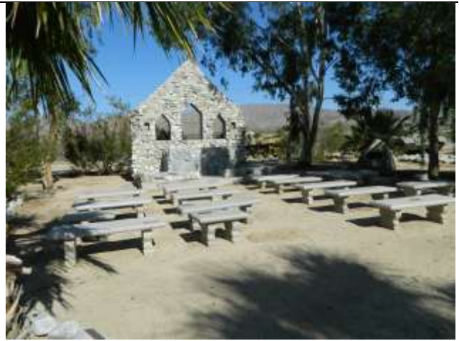
This outdoor chapel was on the grounds. It appears to be a reproduction of a chapel that was built for the Desert Training Center