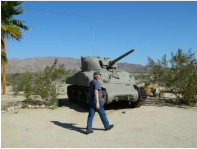
After much searching, the Kommandant finally found an M4 Sherman tank. We didn't check to see if the Continental R975 air-cooled radial engine was still installed.