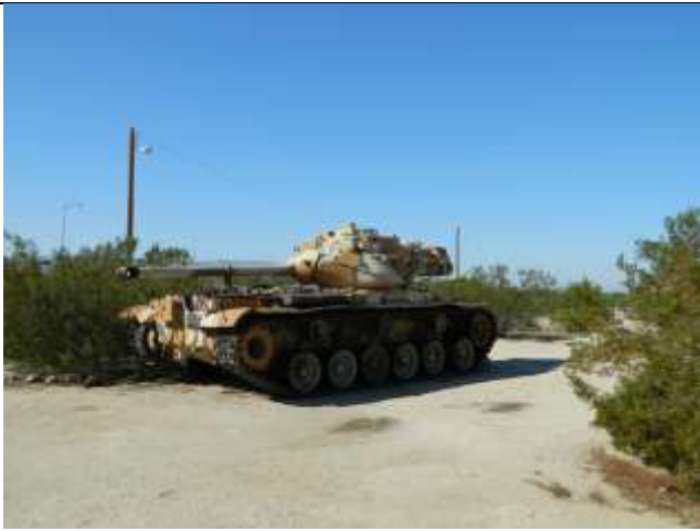
Yet another M-60, this one with the flash suppressor on the end of the barrel