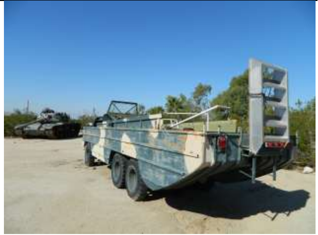
DUKW showing boarding ladder