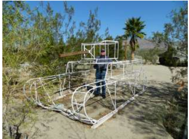
The Kommandant discovers a true find—the Homebuilder's Tank! Constructed of welded steel tube and covered with fabric (Poly-Fiber is well known for its armor capabilities), this tank is much cheaper to operate than solid steel covered tanks. For mobility, just place your tank on a jeep. The wooden gun barrel will fool the recce photos, but won't accidentally hurt anyone. Note the sign on the front saying "Keep Off"