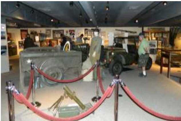
A classic WWII Jeep towing a classic WWII Jeep trailer