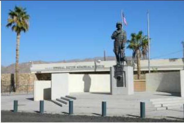
A short walk away from the parking ramp was the entrance to the museum. General Patton and his Executive Officer dog stand watch.

Even though we planned this flyout in mid-October to try to escape higher temperatures, arriving at the museum around 1000 it was already clear that the alcohol in the thermometer was going to continue rising above generally accepted comfortable temperatures. Therefore we decided to visit the outdoor armor (or armour) petting zoo first.