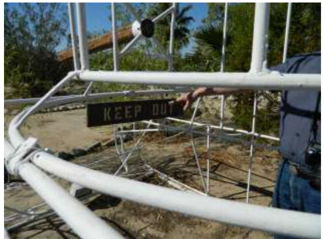
In case you missed the "Keep Off" sign on the outside, on the inside is the complementary "Keep Out" sign