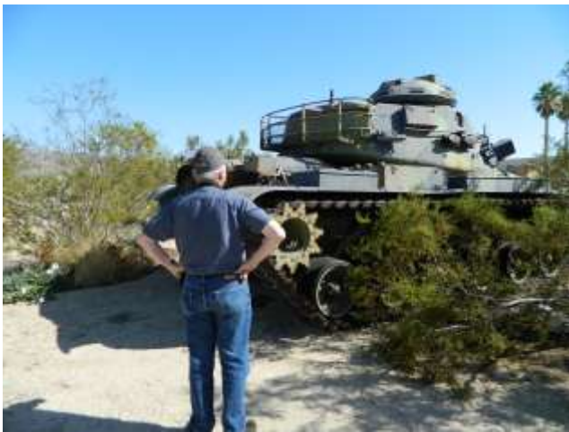
The Kommandant is puzzled by this M-60 which has apparently gone through a weight reduction program. It must certainly be lighter not having to carry that heavy gun barrel around, but combat effectiveness of this modification is questionable.