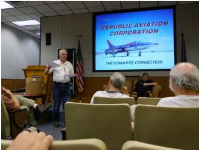
The Kommandant tries to dispose of some excess paperwork