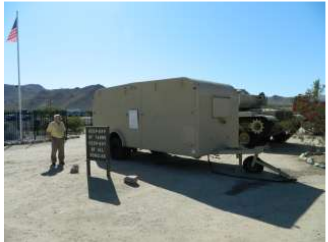
This trailer was special (sic) built for General Patton as a darkroom for developing photographs. That might explain the curious lack of picture windows.