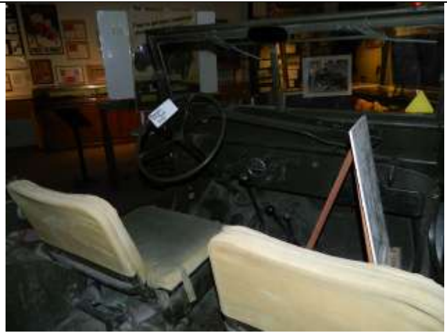
The very simple panel of a WWII Jeep, barely even Day VFR instrumentation. I doubt those seats were upholstered by Oregon Aero.