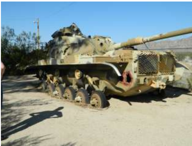
This trackless wonder seems to have sunk into the dirt until the hull is floating. At the near end the drive shaft and gear seems to be missing.