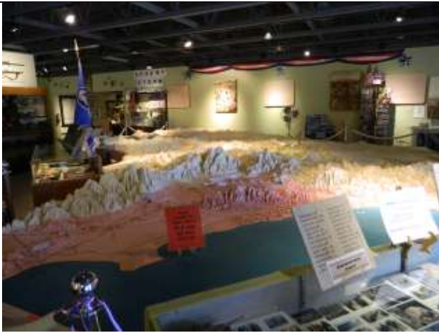
Returning inside we found this very large 3-D representation of Southern California, produced in the 1920s. This view is looking from Los Angeles up toward Las Vegas. The map was made up of many stacked layers, each layer the shape of one contour line on a topographic chart.