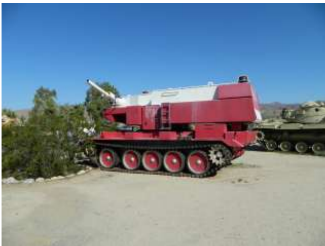
We couldn't find identifying information on this vehicle, but it appeared to be some sort of tracked fire fighting vehicle.