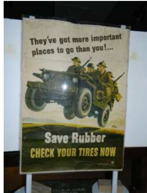
Apparently the problem of building a flying car was solved during WWII, but lost after V-E and V-J Day. Every poster that ever showed a Jeep seemed to have it flying through the air. I've asked many veterans about how this was done, but nobody's talkin'.