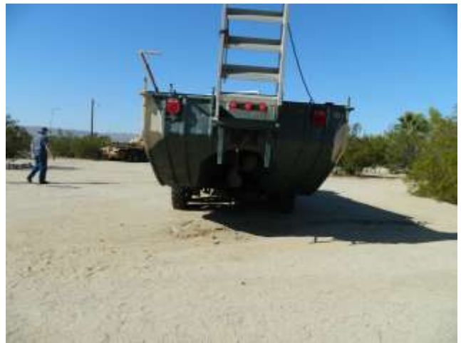
Perhaps not visible in the picture, but buried in the center tunnel is a large screw propeller for propulsion in the water