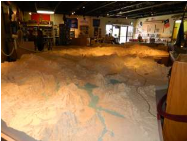
Same map, looking from Lake Mead (which didn't exist in the 1920s, perhaps a modification) and Las Vegas back toward Los Angeles