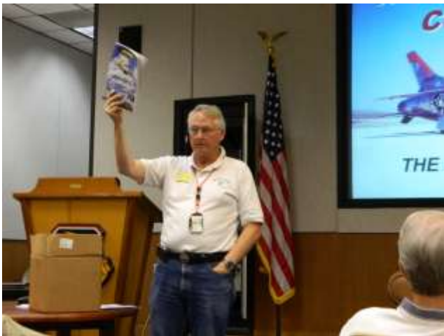
Want a free Wicks catalog? The Kommandant still has a whole bunch