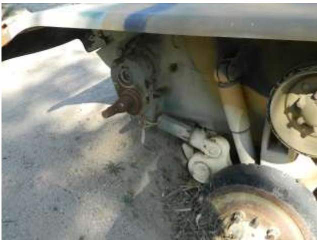
At the other end we found what appears to be the track tensioning mechanism