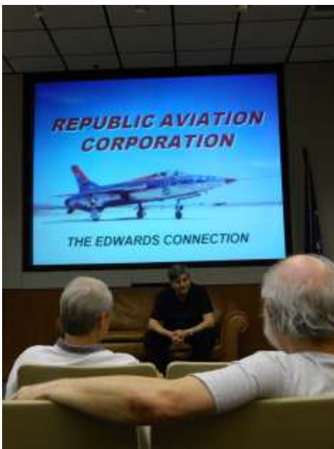
The F-105 Guy ("Little Chief")

in level flight and featured an inverse tapered wing), the F-105 Thunder Chief (Thud), the A-10 Thunderbolt II (Warhog), and the T-46 Thunder Trainer (not really, I made that up). The more keenly observant amongst us might have detected a pattern in the aircraft names (OK, it's "Thunder"! ). All of these aircraft were shown at Edwards in the slides. Interesting side note: following the crash of the Hughes XF-11 in a residential area (featured in the film "The Aviator"), all prototype testing was shifted to sites like Edwards away from populated areas.