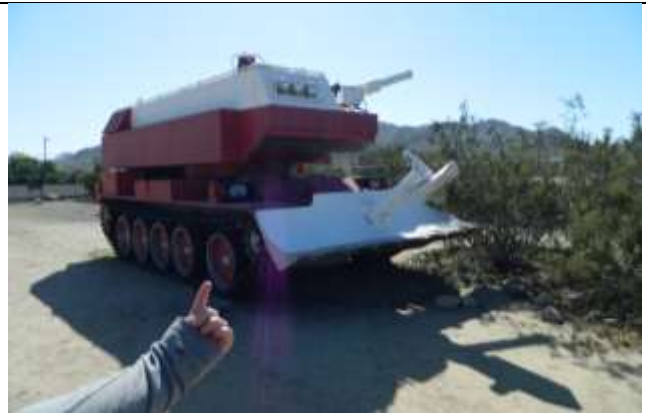
Tuki executes the Project Police Point for the blade on the front of the fire fighting tank