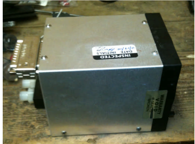
New metal case with RF filter connector mounted to DB25 connector

I disconnected the control head from the instrument panel and tried the ground test with the control head at different distances from the instrument panel. Changing the distance from the instrument panel changed the response of the autopilot to transmissions. This made me think I was on to something. Perhaps the problem was that the metal shield box wasn't grounded (or electrically bonded) to the instrument panel (Theory #6).