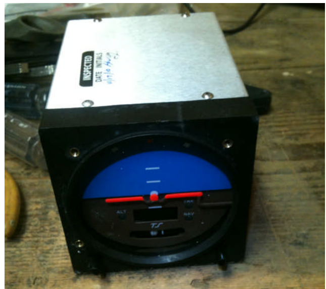
Plastic faceplate which gave an entry path for RF interference