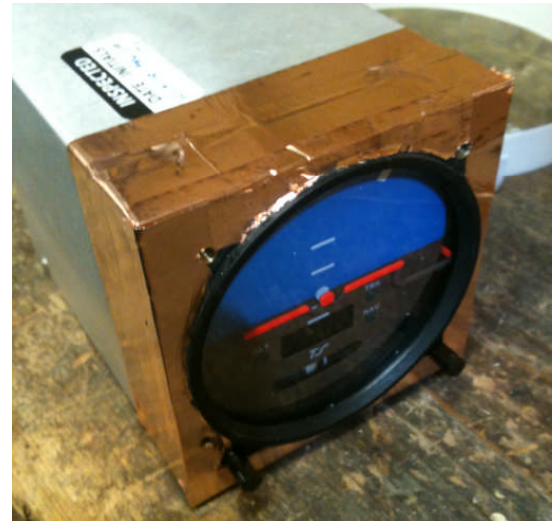
Copper tape wrapped onto front of case to connect with instrument panel

Just in case someone else should ever have this problem, I posted my solution on the TruTrak customer forum so that it would not be forgotten.