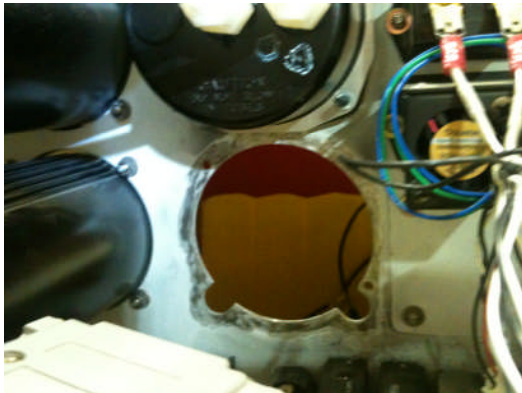
Autopilot mounting hole with non-conductive paint removed

While researching solutions, I came across a roll of copper tape with electrically conductive adhesive (www.amazon.com, part number CFL-5CA/COP07536). I purchased one and used it to wrap the plastic faceplate of the control head. I wrapped from the metal box across the plastic faceplate and around onto the front of the faceplate so that it would contact the instrument panel. The paint was removed from the contact area on the back of the instrument panel. Thus the copper tape with the conductive adhesive formed an electrical connection between the instrument panel and the metal box on the control head, making a complete shield. The control head was reinstalled and the ground test repeated. This time...absolutely no response from the autopilot while transmitting on the radio. Success at last! Subsequent flight testing confirmed that the EMI Dragon had finally been slain!