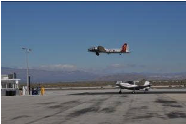
B-17 takes off as a rare Micco SP26A taxis to the fuel pit.