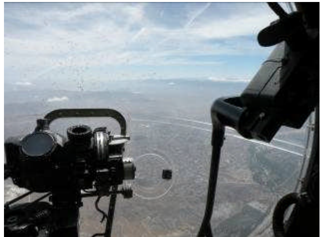
This is at 10,000 feet over Victorville, heading for Cajon Pass and the eastern end of the Los Angeles Basin. In the left of the photo is a Norden bombsight, and to the right is the yoke the bombardier used to guide the airplane on the bomb run.