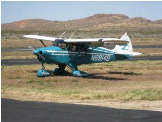
Somebody in a Tri-Pacer in the pattern was called on the radio and invited to the party