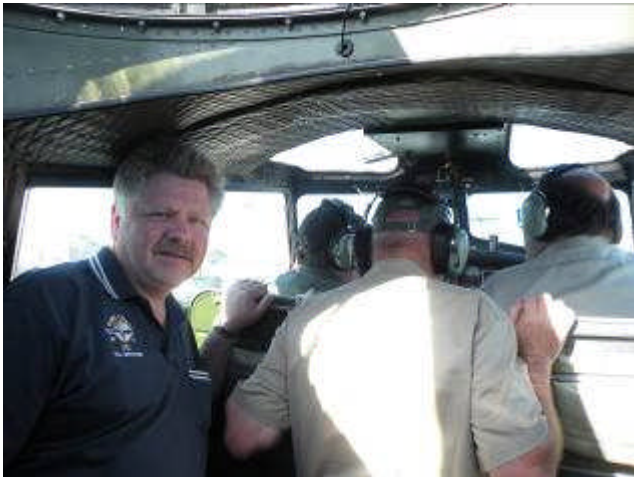
Yours truly in the cockpit during engine run-up while the crew prepared the airplane for Wednesday's local flights.