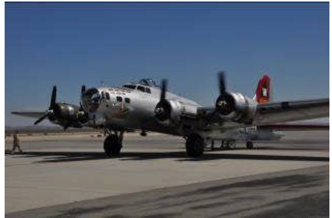
Engine Running Crew Change (ERCC)