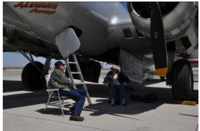
Enter here for the 50 cent tour (which costs more now). Knife spouts wisdom on a variety of topics while Erbman is slowly being sucked into and consumed by his chair