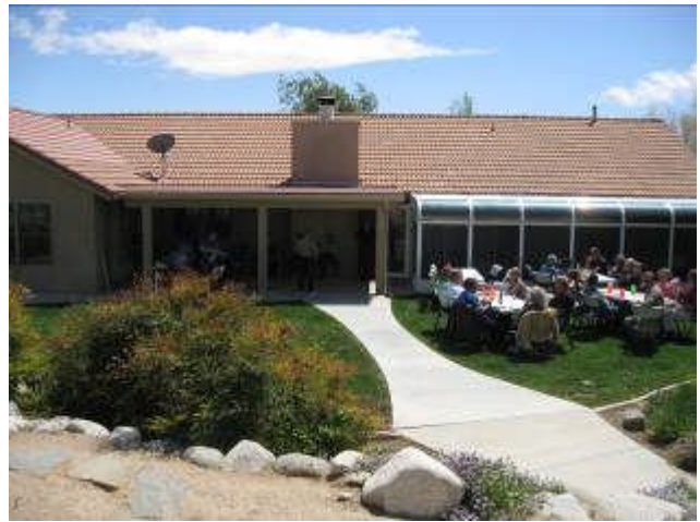
The assembled masses feasting on Ham/Cheeseburgers masterfully cooked by Master Grillmeister Knife and his apprentice Tuki

The long-awaited public rollout of Glasair II-S FT N6940P happened at High Cay on 23 April 2011.