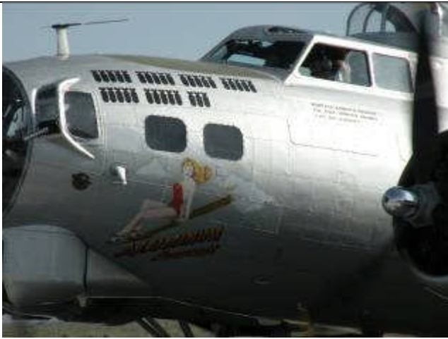
The Aluminum Overcast on the ramp at Lancaster.