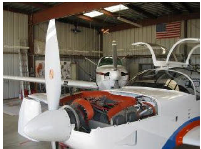
The star of the show with hangar-mate F-35 Banana Raptor