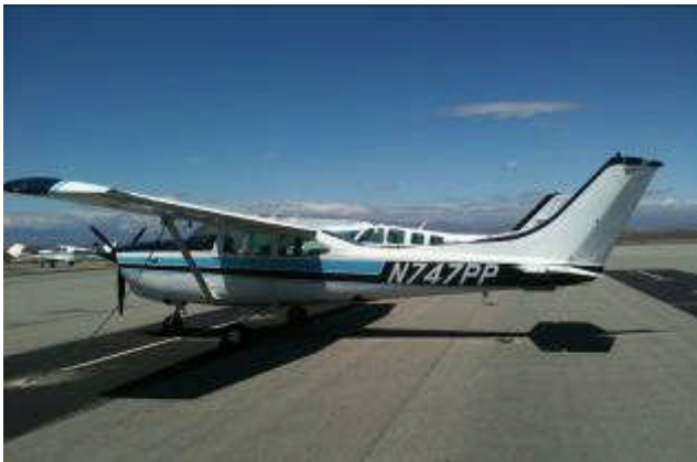
During the tour it was revealed that the Project Police have their own 747. Seems a bit smaller than the President's 747.