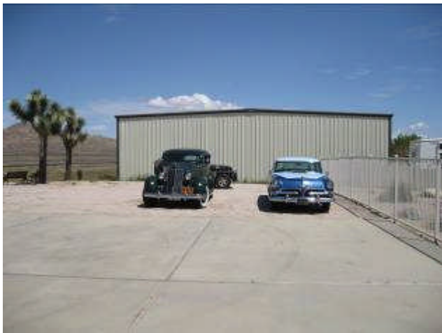
A nicely restored Dodge and Plymouth came to welcome the Glasair to the airport