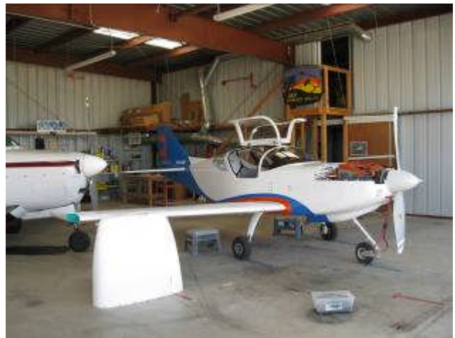
The star of the show