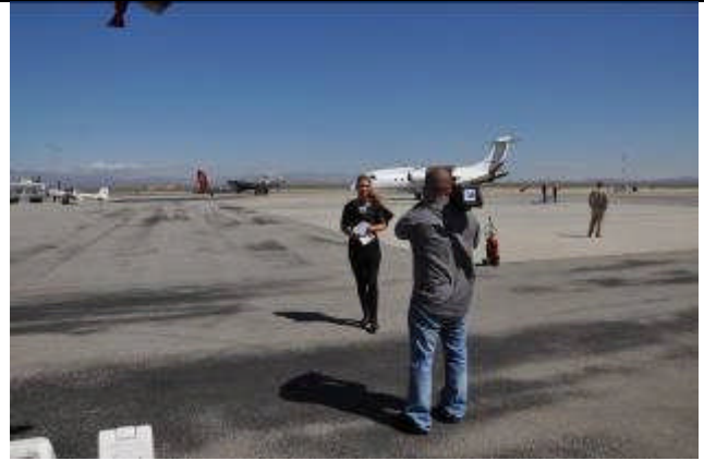
Local TV News Reporter gets on-camera time with Aluminum Overcast in the background