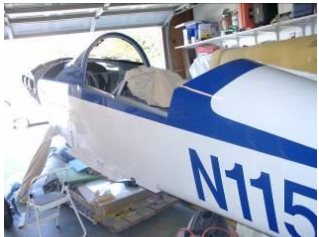
Fuselage in the other direction