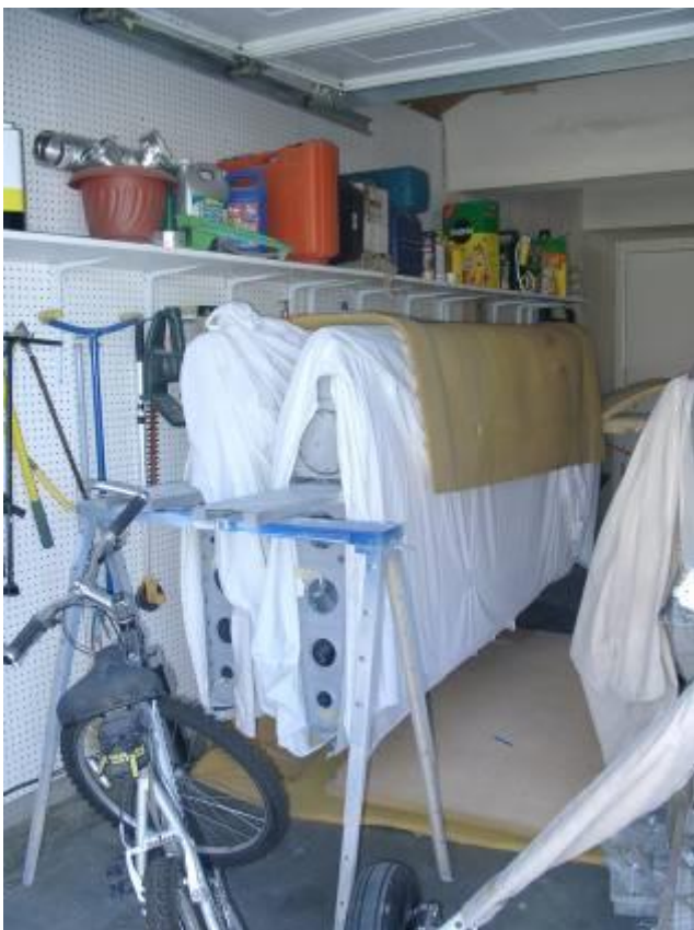
Wings under protective sheets—they really are painted under there