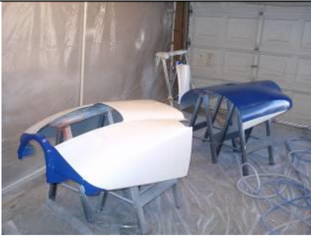
Cowling parts in the paint booth