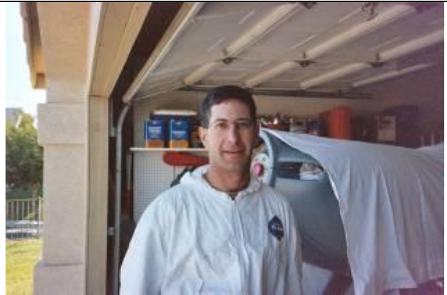
Much later, Evil Editor Zurg directed a photo shoot of the progress...