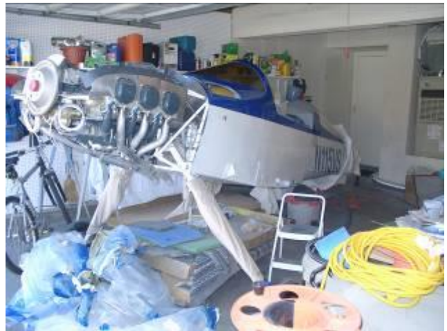
Fuselage with engine installed and N-number applied